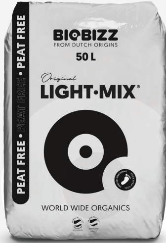
SACS 20L, 50L