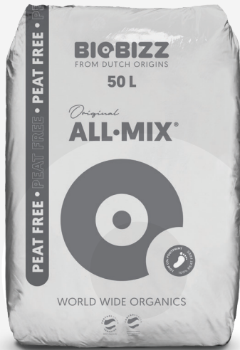
SACS 20L, 50L